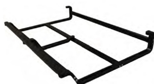
Non-Adjustable Hughes Mobility Mount Pre-Assembled