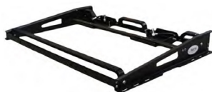
Adjustable Low-Profile Hughes Mobility Mount Pre-Assembled