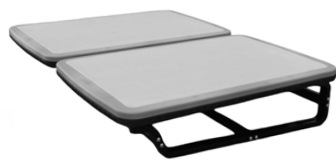
Non-Adjustable Hughes Mobility Mount with Panel