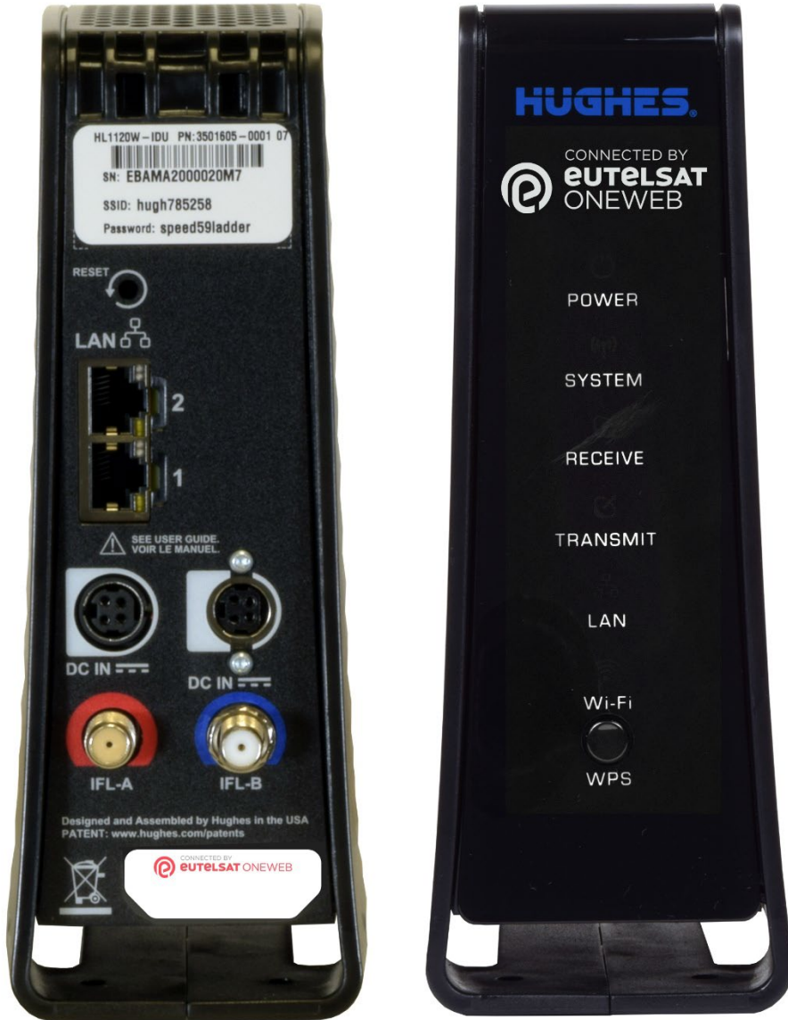
Figure 3: HL1120W-IDU

The HL1120W-IDU hosts a Wi-Fi Router which provides two GigE ethernet ports and Wi-Fi access to the user data network. The Wi-Fi Router also provides access to the local management interface of the UT.