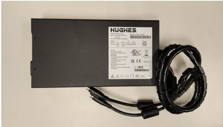
Figure 4: HL1120W-PSU

The HL1120W-PSU is an AC-DC power supply assembly that provides DC power to both IDU and ODU.