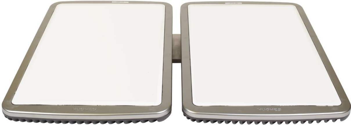
Figure 2: HL1120-ODU

The HL1120-ODU antenna assembly consists of two electronically steered antenna panels – IFL-A panel for receive (Rx) path and IFL-B panel for transmit (Tx) path. Each antenna panel has a Common Control Module (CCM), an RF Conversion Module (RCM) and a Beam Former Array (BFA). The CCM-A has a host processor that runs the UT software for control, management, and network services. The CCM-A also houses a satellite modem that communicates with OneWeb ground network through the OneWeb LEO satellites using the Rx & Tx tracking antennas.