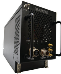
Airborne Microsat Modem (AMM) For VIP en route communications