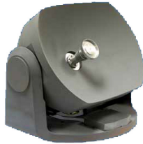
General Dynamic Model 13-17LPA Antenna