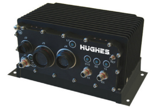
HM 200 Falcon Modem For BLoS ISR applications

Hughes has the unique ability to offer true end-to-end SATCOM solutions, meeting the most demanding bandwidth and reliability requirements of its customers globally. Worldwide connectivity is delivered over both Hughes/EchoStar-owned satellites and its partner operators, in all frequency bands as demanded by end users.