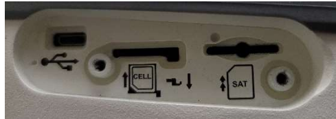
Hughes Terminal SIM slots